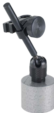
7014-10 (magnetic clamping is non-switchable)